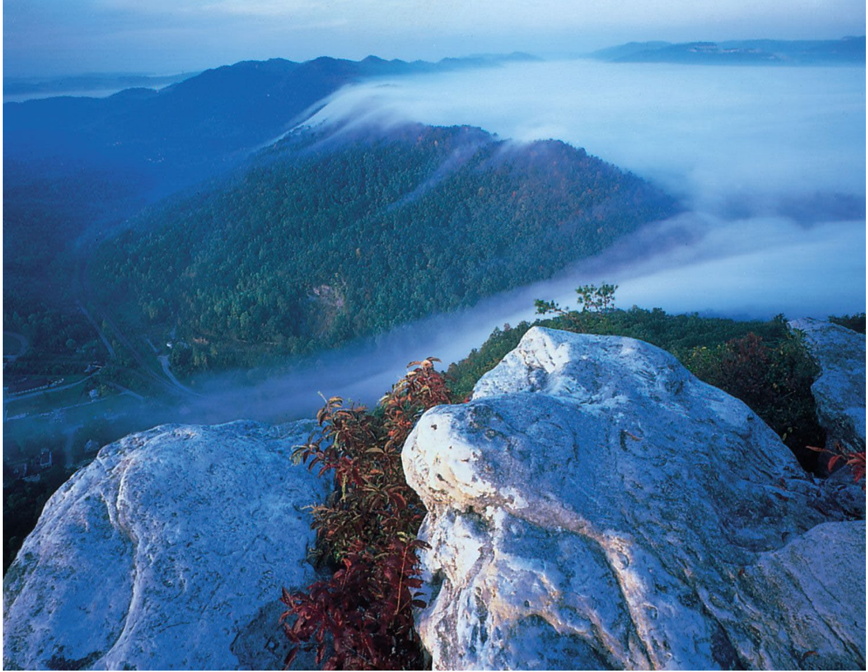
The Cumberland Gap